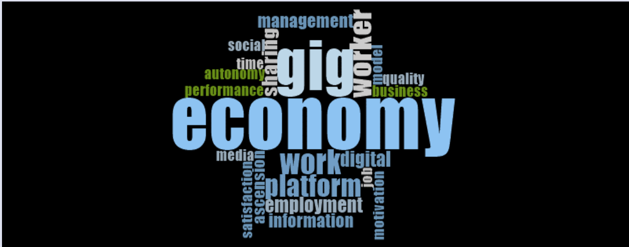
Şekil 3. Anahtar Kelime Sıklığına Göre Bulut Kümeleri Figure 3. Cloud Clusters by Frequency of Keywords

According to the analysis findings, it is obvious that the most used word is gig economy ( N=345 ). It is seen that the second most used keyword for the gig economy is worker ( N=101 ). Then, the words work ( N=84 ), sharing economy ( N=62 ), and employment ( N=41 ) took place in order. When the words are considered in general, it is seen that this situation, in which the concepts of employment, worker, work, labor, and economy are studied, is closely related to the field of labor economy. It is seen that the number of citations in some studies on this field is higher than in others. (Wood et al., 2019; Howcroft & Bergvall-Kareborn, 2019; Lehdonvirta, 2018).