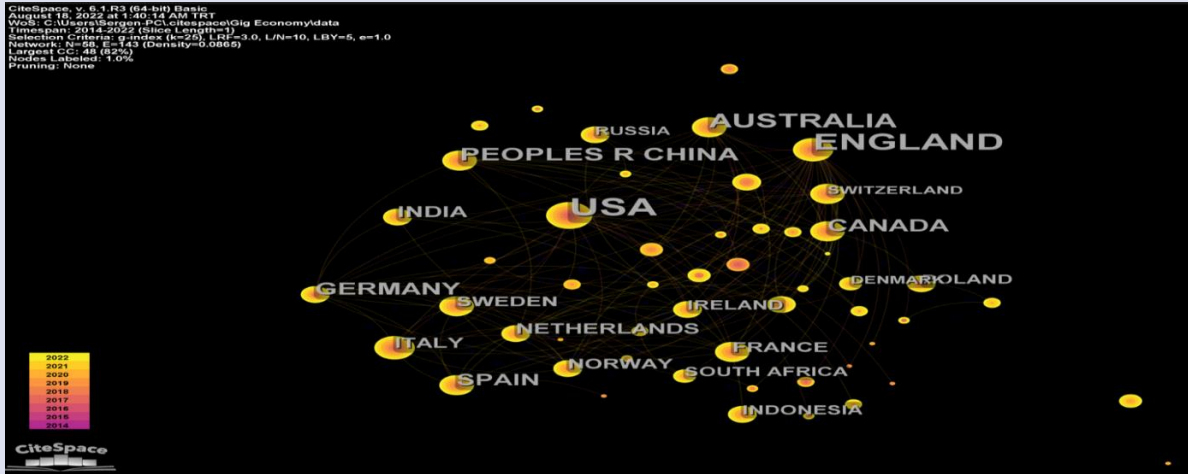
Şekil 2. Ülkeler Arası İlişki Ağı Haritası Figure 2. Inter-Country Relationship Network Map