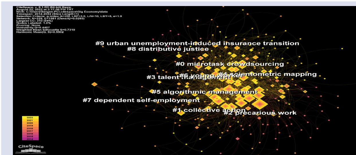
Şekil 4. Anahtar Kelimelerin Küme/Tema Analizi Figure 4. Cluster/Theme Analysis of Keywords

Cluster (theme) analysis is important in terms of reflecting the themes of the most emphasized words and phrases through the algorithm within the software package. Within the scope of theme analysis, the modularity rate indicates the extent to which the clusters diverge from each other. The silhouette value, on the other hand, expresses the quality of the resulting cluster (Chen, 2016). The keywords of the research examined within the scope of the gig economy are very important in terms of determining the clusters by theme/cluster analysis, discovering the content, and providing a holistic perspective.