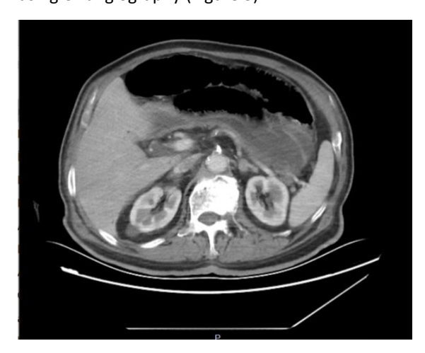
Figure 3 Tomography image of mesenteric ischemia

CT angiography for mesenteric ischemia is the best diagnostic method with 89.4% sensitivity and 99.5% specificity[13]. We diagnosed all of our patients using CT angiography.(Figüre 3)